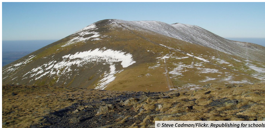
Republishing for schools

Restore Atlantic rainforest — The aim is to create around 667 acres of Atlantic rainforest or temperate rainforest. Rainforests of the British Isles are temperate rainforest, which