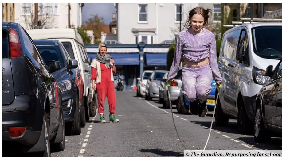
Repurposing for schools

"They are so well received and not just by children. Older residents bring their chairs out and sit and chat, or join in the chalking on the roads. It's always such a joyful, community feel that then